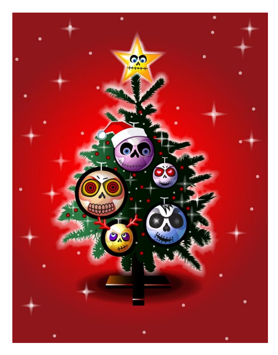
HAPPY HOLIDAYS TO ALL MY FELLOW GOATERS